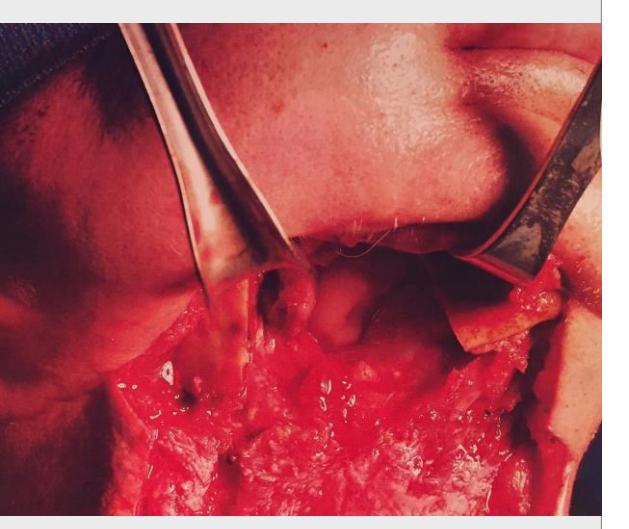
Fig. 3 Segmental mandibular resection completed.

Upon outpatient follow up, his weight was noted to be stable. His reconstructed right mandible appeared intact, mechanically stable, and well healed.