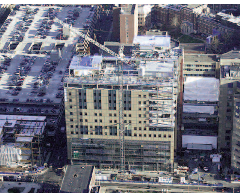
The new cancer hospital is currently under construction and is on schedule to begin opening in October of this year. The 14-story building will be the most comprehensive cancer facility in the region.

For more information, please go to yalecancercenter.org/involved