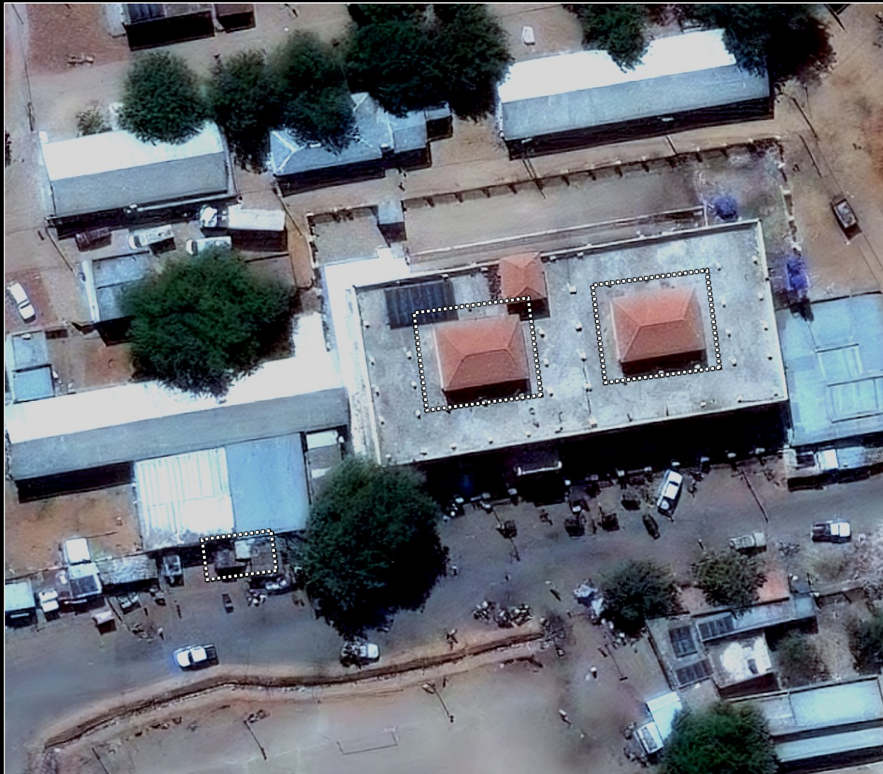
06 January 2026

Conflict-related damage observed between 06 January-24 March 2026