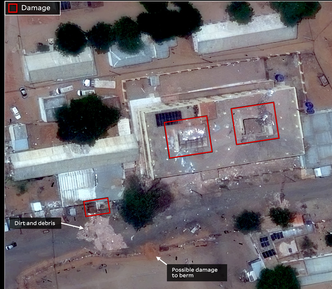
24 March 2026 This image is enhanced with Vantor's HD Imagery Processing

Also observed in imagery collected on 24 March is apparent dirt and debris in the road near one of the locations of damage in front of the hospital. Possible damage to a berm located across the street from the hospital is also visible on this date.