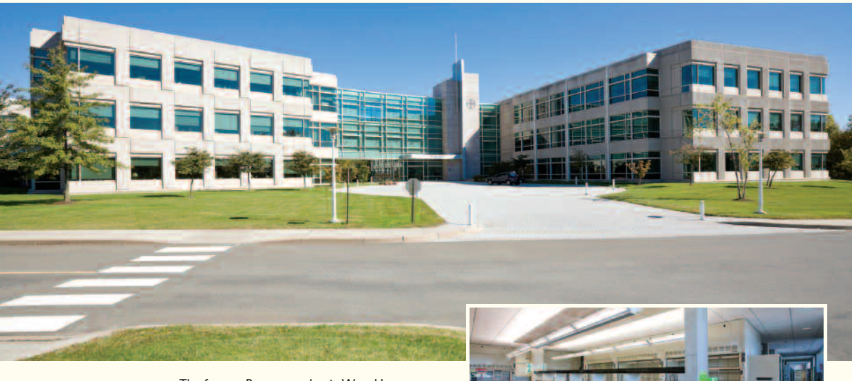
The former Bayer complex in West Haven

>> West Campus Expansion continued from page