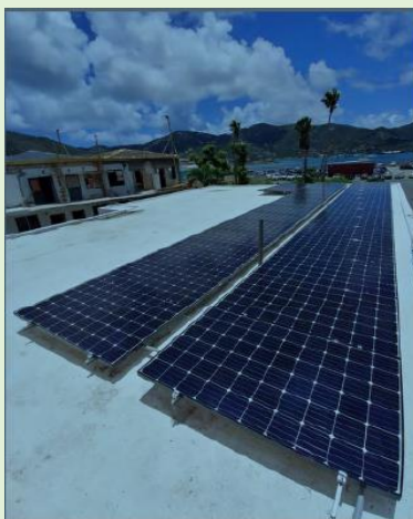
B: Solar panels on roof