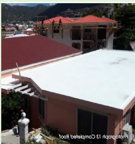
A: Roof painted white