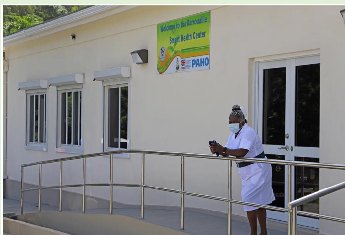
Figure 2: Sign outside Barrouallie Smart Health Centre, Saint Vincent and the Grenadines