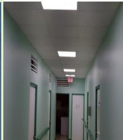
C: Use of LED bulbs

Source: Government of the British Virgin Islands et al. (2020); photos: copyright © Pan American Health Organization, 2020.