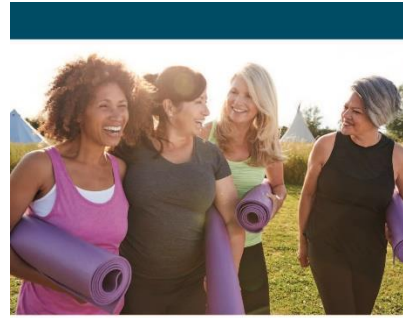
Yale Urology Pelvic Floor Disorders