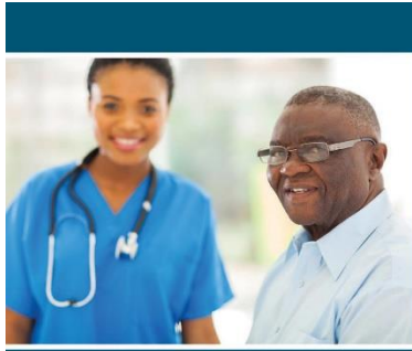
Yale Urology Kidney Stones