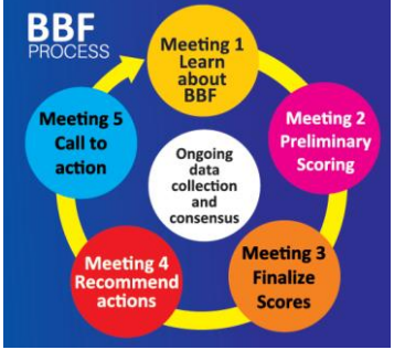
<sup>1</sup> Perez-Escamilla et al Advances in Nutrition (2012)