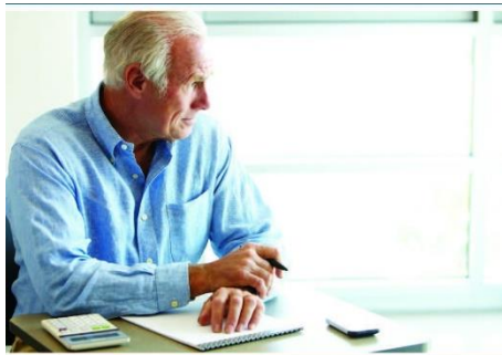
Yale Urology Benign Prostatic Hyperplasia

As a new resource for patients and physicians, informational rack cards are now available for the male urologic condition, Benign Prostatic Hyperplasia (BPH). This rack card is the first in a series of patient materials being produced for the department.