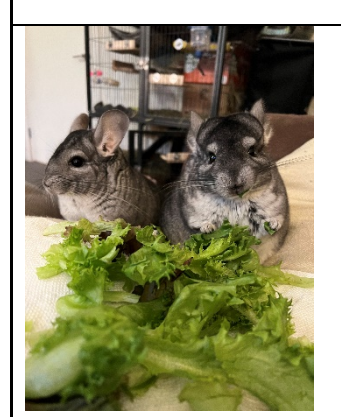
Milo and Chido (Chinchillas)*

Favorite food(s): I will do anything for oats. What you're most likely to be found doing on a day off: Trying to escape my palace of a cage to explore the rest of mom and dad's house, and maybe find oats on the floor somewhere... Your #1 goal for internship: To prove that 2-year-olds can be competent interns, too!