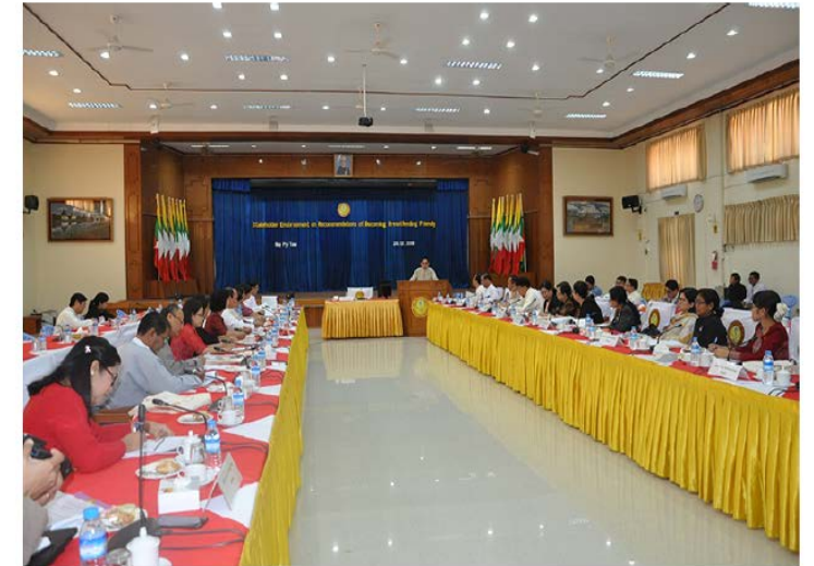
Union Minister Dr. Myint Htwe delivers the speech at the meeting of Stakeholder Endorsement on Recommendations of Becoming Breastfeeding Friendly in Nay Pyi Taw.