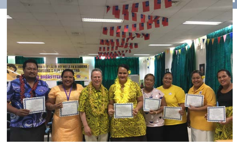
MOHS takes steps to boost breastfeeding rate