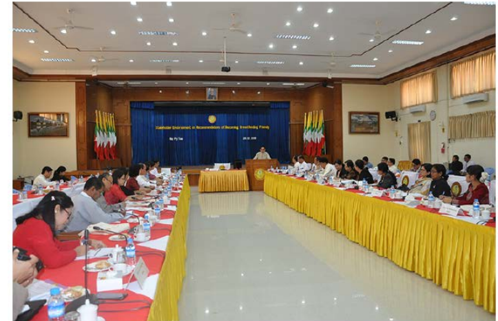
Union Minister Dr. Myint Htwe delivers the speech at the meeting of Stakeholder Endorsement on Recommendations of Becoming Breastfeeding Friendly in Nay Pyi Taw.

http://www.globalnewlightofmyanmar.com/mohs-takes-steps-to-boost-breastfeeding-rate/