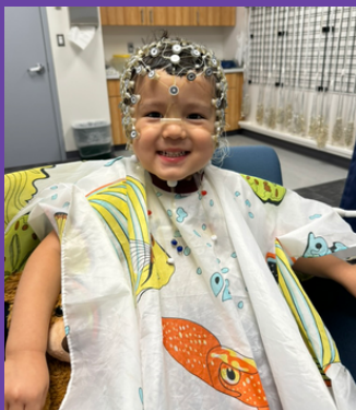
Check out how we measure brain waves! Children wear this "hat" and watch movies.

If you have a child between the ages of 3 and 17 with Intellectual Disability and/or Angelman syndrome, please consider partnering with us in this important research! We will work together to design a research experience to maximize your child's comfort and enjoyment.