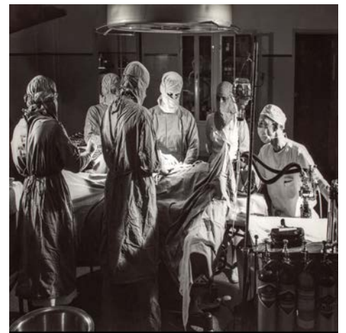
Yale New Haven Hospital Operating Room 1950