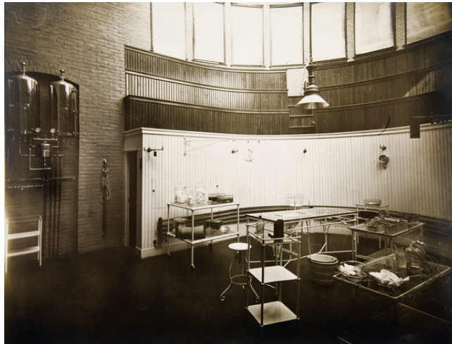
Farnam amphitheater before 1915