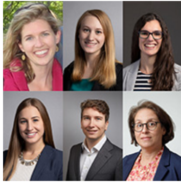
Faculty Development Fund Awardees Announced