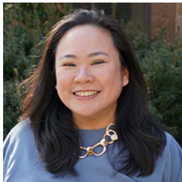
Spencer Foundation grant for pilot project looking at notions of quality in preschool programs