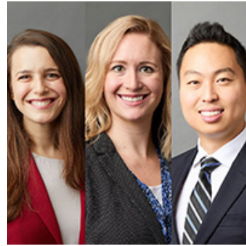
Lustman, Detre Award Recipients Announced