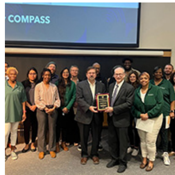
Elm City COMPASS honored at Yale-NAMI Conference on Neuroscience & Mental Health