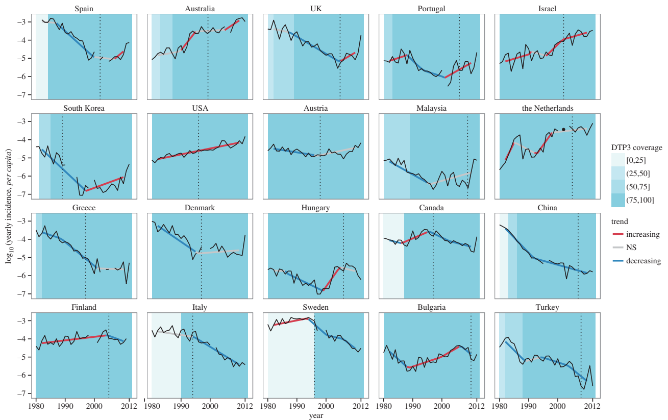
Figure 1. Annual incidence data in 20 countries that switched to aP vaccines for primary immunization. We extracted 1980–2012 yearly case counts and pertussis vaccine coverage estimates from the WHO database ( http://www.who.int/immunization/monitoring_surveillance/data/en/ ). For definiteness, we restricted our analysis to countries with more than 80% complete case count and more than 5 million inhabitants. Before analysis, incidence data were \log_{10} -transformed and a 5-year moving average was applied to remove the known 2–5 year cycles [21]. To detect long-term trends in pertussis reports, we proceeded in two steps. First, a series of segmented regression models with 0–3 breakpoints and time segments longer than 5 years were applied for each country [3,20]; of these, the most parsimonious model was selected according to the Bayesian information criterion. Second, to account for autocorrelation, we used generalized least-squares on each time segment identified in the first step, assuming the residuals autocorrelation structure followed an autoregressive process of order 1. For each country, the time segments were then classified according to their slope, as increasing (significantly positive slope), decreasing (significantly negative slope) or not significant. For each country, we represent the annual incidence (black solid lines), the fitted values from segmented regression, coloured according to the trend (red lines: significantly increasing; grey lines: no significant trend; blue lines: significantly decreasing), and the date of switch to aP vaccination (black vertical dotted lines). Coloured blue areas indicate the vaccine coverage for the third dose of DTaP vaccine. From left to right and top to bottom, countries are ranked by decreasing value of the last slope.

Surprisingly, while these complexities leave key questions in pertussis unanswered, a number of robust opinions are frequently expressed (illustrated in electronic supplementary material, figure S6). In particular, pertussis is resurgent universally [11,12]; whole-cell and acellular pertussis (aP) vaccines do not protect against transmission [13–15] and that waning of infection- or vaccine-derived immunity generates an endemic pool of adults, who act as a reservoir of transmission to young children [15–17]. In this review, we re-examine the evidence supporting these widespread opinions and propose that they are inconsistent with the body of evidence taken as a whole. Finally, we highlight promising ideas that may lead to a coherent picture of pertussis epidemiology.