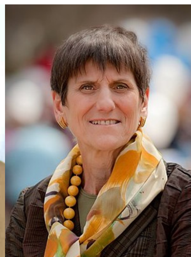
Congresswoman Rosa DeLauro U.S. Representative Connecticut's 3rd Congressional District