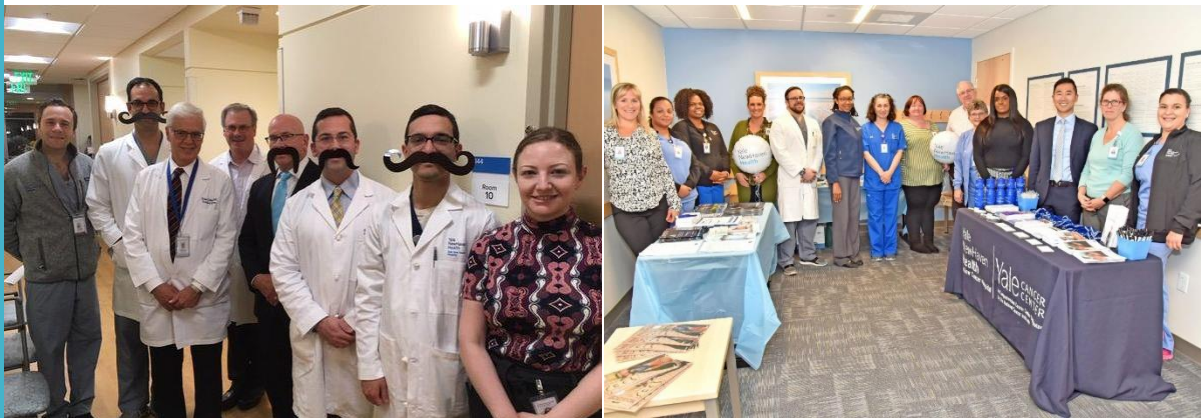
Men's Health Fair - New Haven.

The event in Bridgeport screened 18 men, while New London had 17 attendees, and the Men's Health Fair in New Haven registered 30 men for screenings and health information.