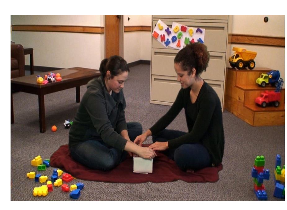
Figure 1. ET paradigm in which actors speak during a shared activity.