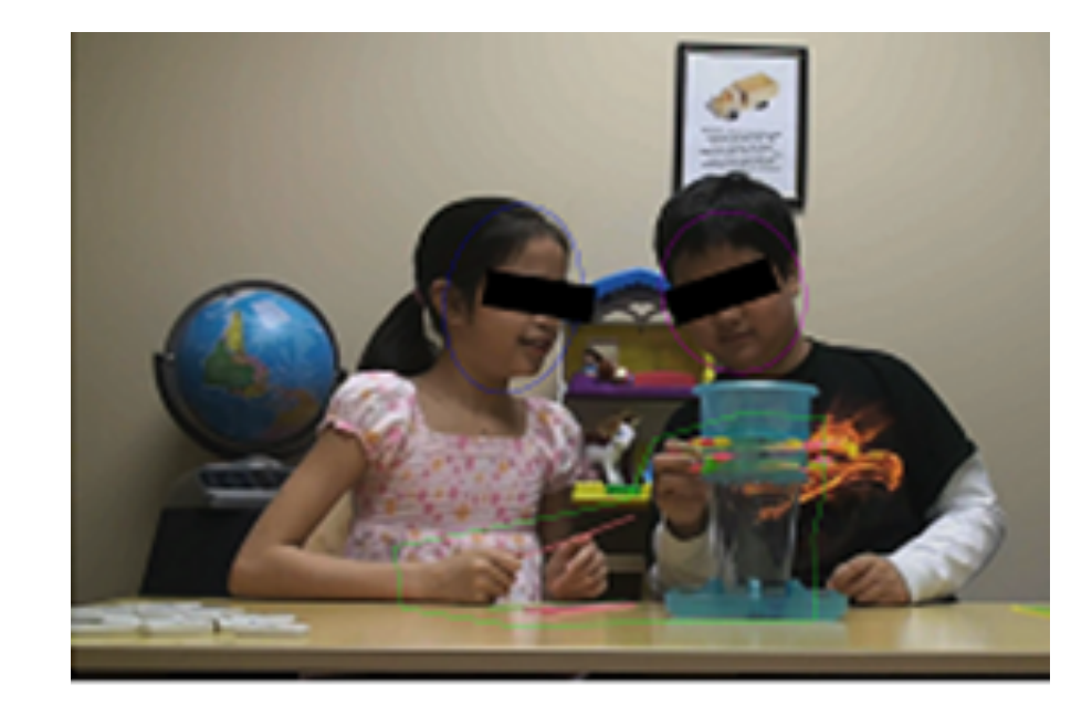
Figure 2. ET paradigm in which actors do not speak during a shared activity.