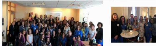
7 th Annual Claire Puklin Clinical Excellence in Urologic Nursing Award Recipients