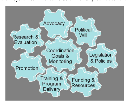
Figure 2 The breastfeeding gear model for scaling up and sustainability of breastfeeding programs.

Scale up has been attained through extensive use of health communications strategies and massive professional and paraprofessional training/education efforts based on cascade training models. Scale up requires a high degree of intersectoral coordination, usually at the national and local levels, based on a flexible decentralized structure, and sustainability requires the availability of low-cost and rapid-response monitoring and evaluation systems. This conclusion is fully consistent with the