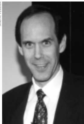
Dr. Brian Druker.

being tested on several other cancer types. Dr. Druker focused his discussion on the future of cancer research; he closed his talk stating, "Scientific discoveries come out of the background of huge amounts of knowledge, to think about the future you need to look at the past." Dr. Druker's visit was co-sponsored by Yale Cancer Center and Novartis.