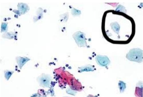
Trichomonad demonstrated on wet prep (All images licensed for public use through Creative Commons)