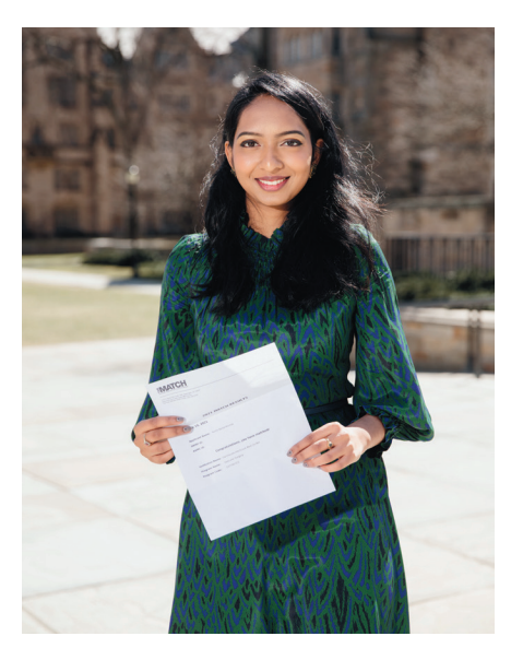
ABOVE: The Class of 2021 celebrated Match Day virtually for the second year in a row. Students were joined by faculty, staff, family, and friends via Zoom for a gathering that was filled with excitement for the significance of the event.

The sixth-oldest medical school in the United States, it was chartered by the Connecticut General Assembly in 1810 as the Medical Institution of Yale College, located first on Grove Street, then at 150 York Street. Since 1924, it has occupied Sterling Hall of Medicine at 333 Cedar Street and surrounding buildings. It has awarded 9,302 medical degrees since 1814. There are 5,629 living alumni with MD degrees, 5,274 with MPH degrees, and 1,319 alumni of the Physician Associate Program with the PA-C certificate or MMSc degree, and 32 alumni of the Physician Assistant Online Program.