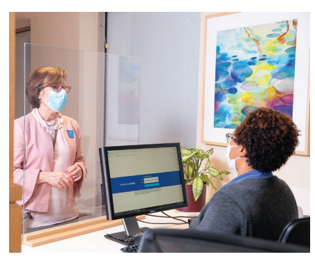
TOP: Medical appointments were quickly converted to telehealth for many patients during the pandemic to avoid interruptions to care.

BOTTOM: When in-person medical appointments resumed, Yale Medicine established protocols that minimized contact in order to reduce transmission of COVID-19.