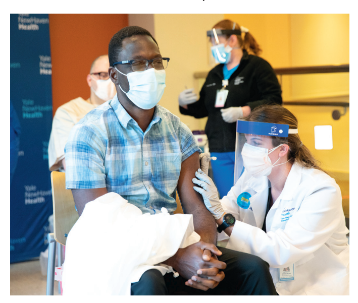
Yale School of Medicine investigators led trials of the COVID-19 Pfizer-BioNTech vaccine in adults and children, and Remdesivir, a therapeutic drug used to treat the disease.

The Yale Center for Clinical Investigation facilitates the training of clinical and translational scientists and provides infrastructure for innovative and collaborative research directed at improving patient care. It funds up to 20 YCCI Scholars yearly and supports investigators in the areas of biostatistics, bioinformatics, study design, core technologies, regulatory review, patient recruitment, and community-based research.