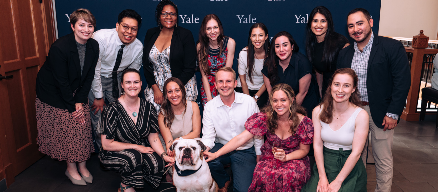
2023-24 Fellows celebrating a successful year at their June graduation.